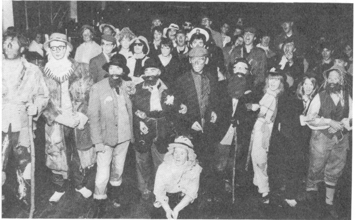
A sight to gladden the hearts of Steptoe and Son

With the motley crew assembled, the more serious ceremonies of the evening took place. The judging and awarding of the title of Best/Worst Dressed Lady and Gentleman Tramp of the Year was conducted by Canteen Manager